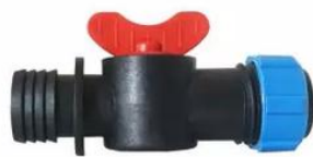
Valve for Spray Tube and PVC Pipe