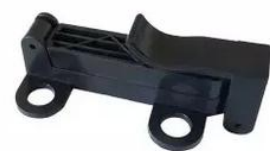
Fittings for Micro Spray Tube