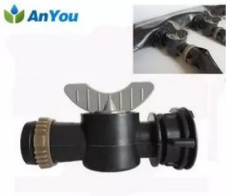
Valve for Spray Tube